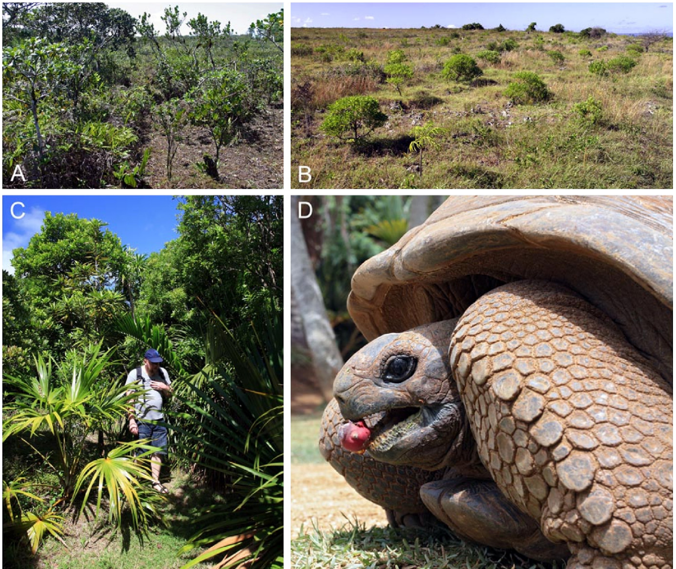
Fig. 2. Restoration of plant–animal mutualisms on oceanic islands. Options for restoring native pollination and seed dispersal interactions are manifold. They include weeding or eradicating alien invasive species, as well as actively facilitating increases in populations of native species, or even replacing extinct species with taxon substitutes. For example, while manual weeding of introduced and invasive plant species in restoration areas in Mauritius creates a lot of initial disturbance (A; compare right-hand side, weeded area with left-hand side, unweeded area), it rapidly results in an increase in interactions between native plants and native flower visitors, compared to non-weeded areas (Kaiser-Bunbury et al., 2009). On extremely degraded islands, such as Rodrigues in the Indian Ocean, another option is to recreate native habitats from scratch. Here, in the Francois Leguat Reserve, some 100,000 native seedlings have been planted in 2007 (B). In another conservation area on Rodrigues, Grande Montagne, similar plantings in 1998 have already resulted in a low forest of 3–6 m in height (C), with many plants already flowering and producing fruits. A next logical step would be to rewild such habitats with taxon substitutions, replacing extinct endemic frugivores with extant analogues, for example Aldabra giant tortoises Aldabrachelys gigantea to replace the two extinct Cylindraspis giant tortoises (D).