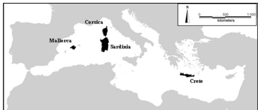
Fig. 1 Map of the Mediterranean Basin including the four sampled islands (Mallorca, Corsica, Sardinia and Crete) for the presence of the invaders Ailanthus altissima , Carpobrotus spp. and Oxalis pes-caprae

To stratify the sampling, each UTM cell was divided into 100 1 × 1 km squares, within which one random point was selected and surveyed. At each point, the following data were recorded: (1) the UTM East and North coordinates ( East, North ), (2) the habitat types within a 50 m radius of the random point (i.e., agricultural, coastal, fen, forest, grassland, railroad, river, road, rocky, ruderal, scrub, or urban), (3) the presence/absence of each invader in each habitat found within the 50 m radius area, and (4) the abundance (% cover) of each invader in each habitat according to a DAFOR scale (Rich et al. 2005): Dominant (>75%), Abundant (50–75%), Frequent (25–50%), Occasional (5–25%) and Rare (<5%). For analysis, the DAFOR semi-quantitative categories (i.e., 1–5) were considered. Therefore, at each random point, we could obtain the frequency of occurrence and cover abundance values of the invader as well as the overall availability of each habitat. Variation in the number of sampling points per invader and island occurred due to the inaccessibility of certain