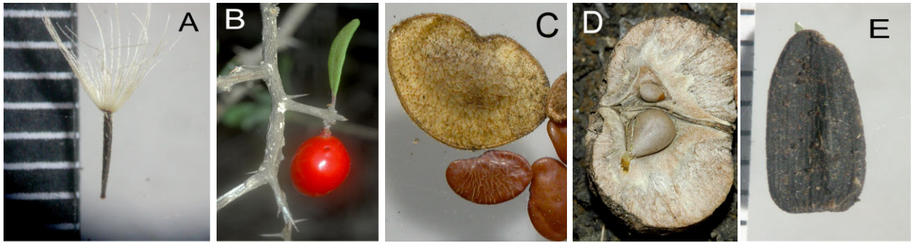
Figure 1. Species classified into the five categories of long-distance dispersal to islands based on morphological traits: A, fruit pappus related to anemochory in Pectis tenuifolia (DC.) Sch.Bip. (Asteraceae); B, fleshy fruit related to endozoochory in Castela galapageia Hook.f. (Simaroubaceae); C, glabrous seeds, but hairy loment (fruit) related to epizoochory in Desmodium procumbens (Mill.) Hitchc. (Fabaceae); D, cork-like fruits related to thalassochory in Hippomane mancinella L. (Euphorbiaceae); and E, unspecialized fruit of Scaevola affinis Hook.f. (Asteraceae).

assembled and analysed (289 lowland species, five syndrome categories). The total probability of each MDD syndrome category (the dependent variable used in the analyses) was obtained by the summation of proportions of the syndrome category from each species divided by the number of lowland species for the flora of the Galápagos Islands. These proportions of dispersal syndromes were considered the starting point for plant colonization, i.e. the proportions of trait sets displayed by all the species in the archipelago, irrespective of the number of islands subsequently colonized.